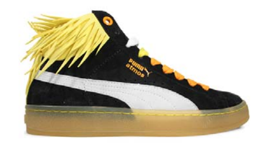
Puma / Atmos X /