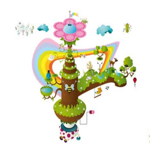
ALDE / The Changers /